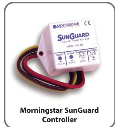
Morningstar SunGuard Controller

The SunGuard is the little brother of the SunSaver and it is only available in a 12V version with a 4 amp capacity. It is also a PWM controller with temperature compensation and simple 4 wire hookup. The SunGuard has a slightly lower output voltage (14.1 V) than the SunSaver and ProStar and may not be the best choice for flooded batteries that require a higher voltage. Five year warranty.