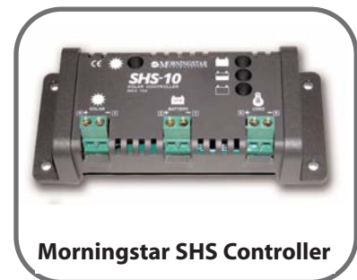
Morningstar SHS Controller