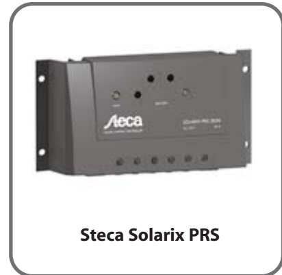
Steca Solarix PRS

The simplicity and high performance of the Steca Solarix PRS solar charge controller makes it particularly appealing. At the same time, it offers a modern design and a convenient display, all at an extremely attractive price. Several LEDs in various colours emulate a tank display, which gives information on the battery's state of charge. Here, Steca's latest algorithms are employed, resulting in optimal battery maintenance. The Solarix PRS charge controllers are equipped with an electronic fuse, thus making optimal protection possible. They operate on the serial principle, and separate the solar module from the battery in order to protect it against overcharging. For larger projects, the charge controllers can also be equipped with special functions. These include a night light function, a selectable charging plateau and deep-discharge protection voltages. Two year warranty.